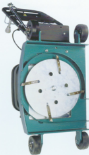
Carbide Tipped Blades

Ease of use, safety, durability and efficiency are standard features in the Olympia line of hand controlled edgers. Featuring the latest innovations in design the Olympia Edger line sets a new standard for the industry. From the centralized controls in the handle to the proven reliability of its engine and cutting mechanism Olympia Hand Edgers meet all your ice edging needs